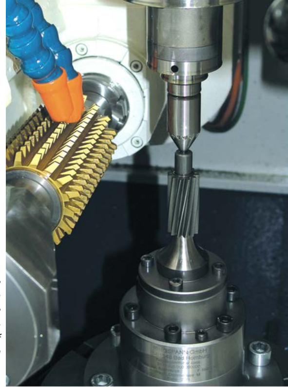
Use of a complete RINGSPANN clamping fixture of "taper sleeve flange chuck" execution in the milling of the teeth flanks of a pump gear.

The new standard clamping fixtures by RINGSPANN have already been able to demonstrate their efficiency in numerous areas of application. For example: in the milling of truck crown wheels, in the lapping of motorcar crown wheels, in the grinding of helical gearings of spur wheels, in the milling of gear components for wind energy plants, in the machining of turbine stages, in the clamping of gear wheels for noise tests and in many other cases as well. To optimise their manufacturing processes, several famous machine tool manufacturers now recommend their customers the new standard clamping fixtures by RINGSPANN as a clamping technology solution which is economical and versatile in equal measure.