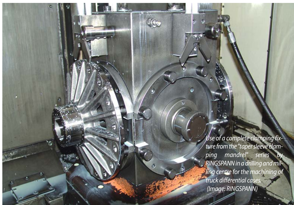
Use of a complete clamping fixture from the "taper sleeve clamping mandrel" series by RINGSPANN in a drilling and milling centre for the machining of truck differential cases.

The practical application of the new precision clamping fixtures by RINGSPANN is quite simple, irrespectively of the construction type: when clamping, the workpieces are centered, pulled against the true backstop surface and aligned thereby. The clamping fixture evenly grasps the entire circumference of the workpiece. This rules out any eccentric deformation