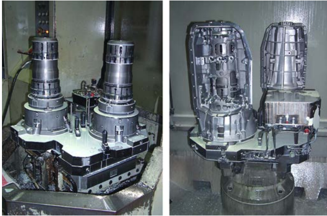
The development and realisation of individual special productions in the area of clamping technology also has great tradition at RINGSPANN – such as this differential taper collet flange mandrel, which in a machining centre performs the aligning, centering and internal clamping of large transmission cases made of cast aluminium.

and permits an accurate, firmly-enclosing all-round clamping – which explains the special suitability for workpieces where deformation is a critical factor! The actuating force applied to the clamping fixture is translated without friction into a five to ten times greater radial force for clamping the workpiece. In practice, this ultimately makes the transmission of high torques possible as well as a higher metal-cutting performance.